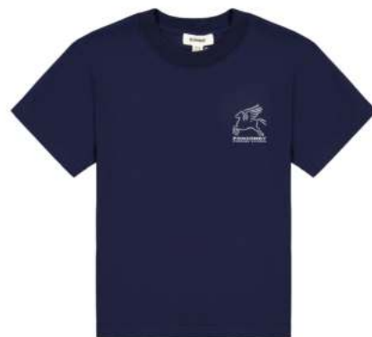
SCHOOL LOGO TEE $40

100% ORGANIC COTTON 180GSM | GOTS CERTIFIED