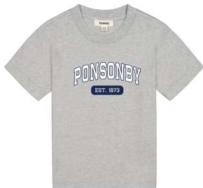
SCHOOL VARSITY TEE $40